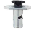
Upper Pin Head